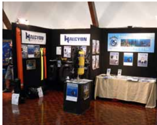
Halcyon and GUE stands

The event comprised a main exhibitors hall, where a range of exhibitors - retailers, training organisations, universities, environmental groups, equipment wholesalers, travel companies and even the Royal NZ Navy had displays and information for visitors. Outside of this hall there was also a photography exhibition and competition, a shipwreck artefacts display, a swimming pool for try-dives and of course the two auditoriums for the presentations throughout the weekend.