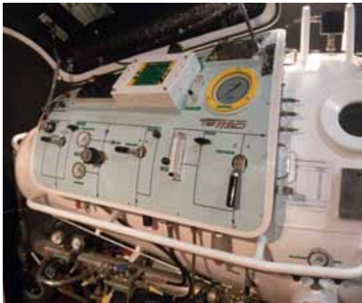
NAVY recompression chamber