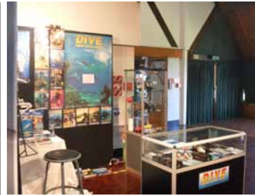
Dive New Zealand magazine