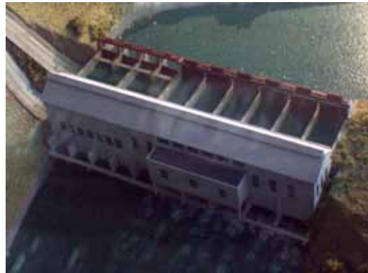
Architect's model of Horahora