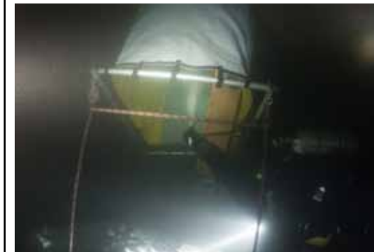
A picture of the habitat in the cave.